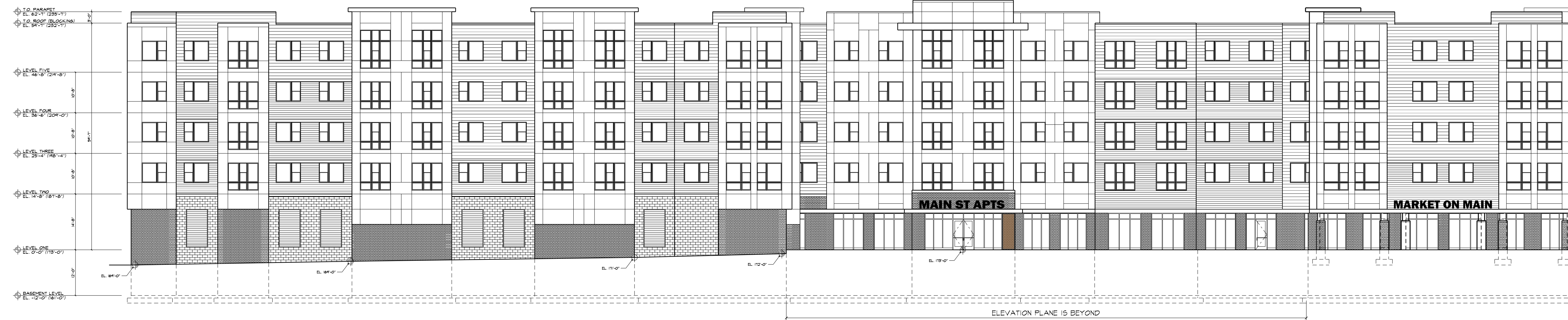
1 WEST (MAIN ST.) ELEVATION 1/16" = 1'-0"