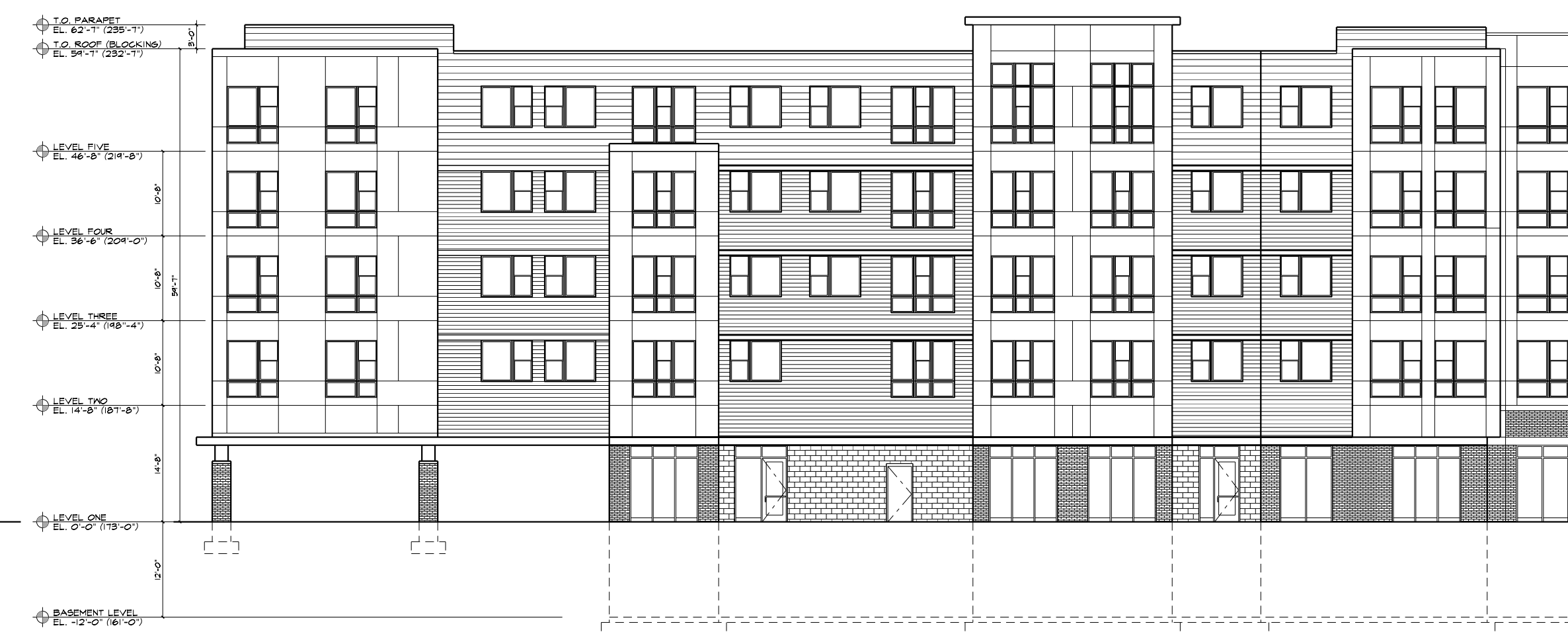
4 SOUTH ELEVATION 1/16" = 1'-0"