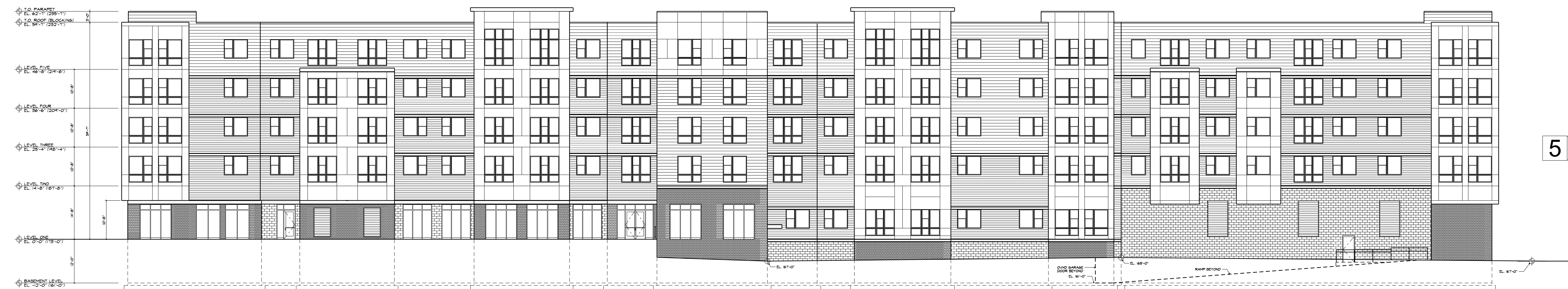
6 EAST (REAR) ELEVATION 1/16" = 1'-0"