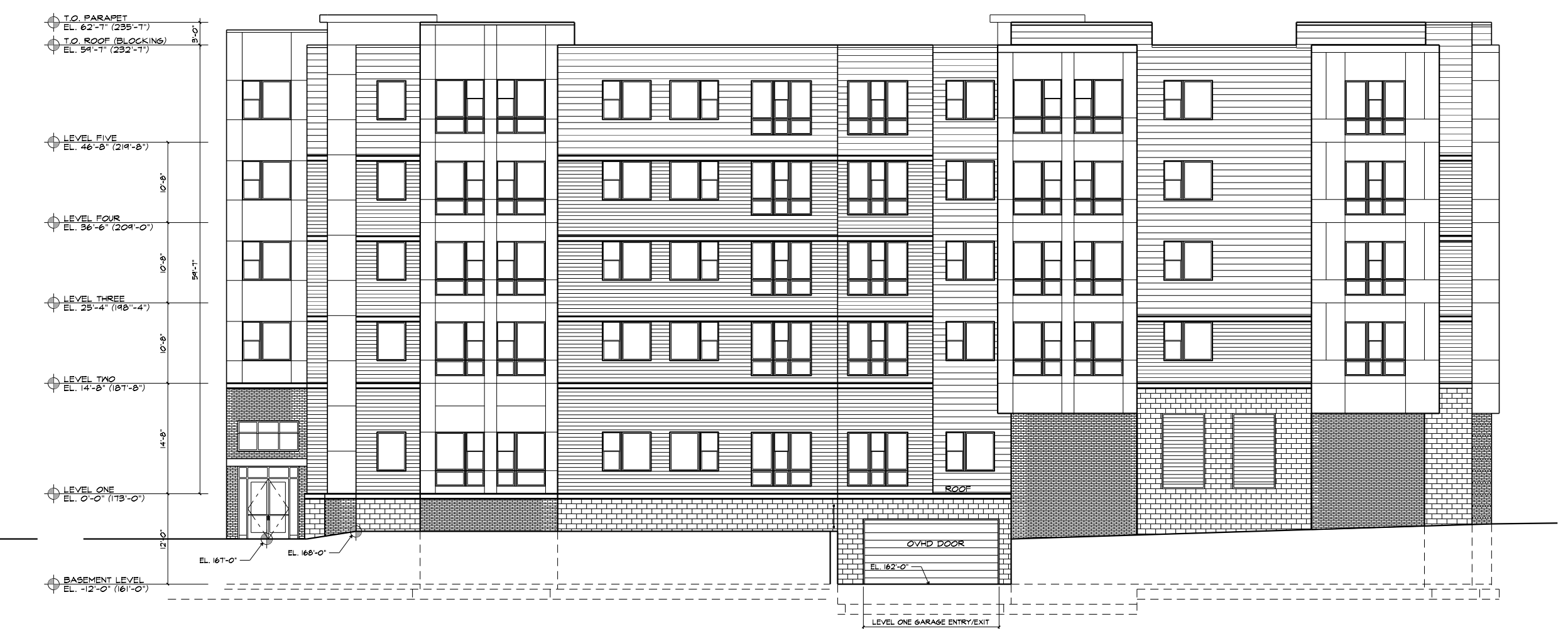
5 NORTH ELEVATION 1/16" = 1'-0"