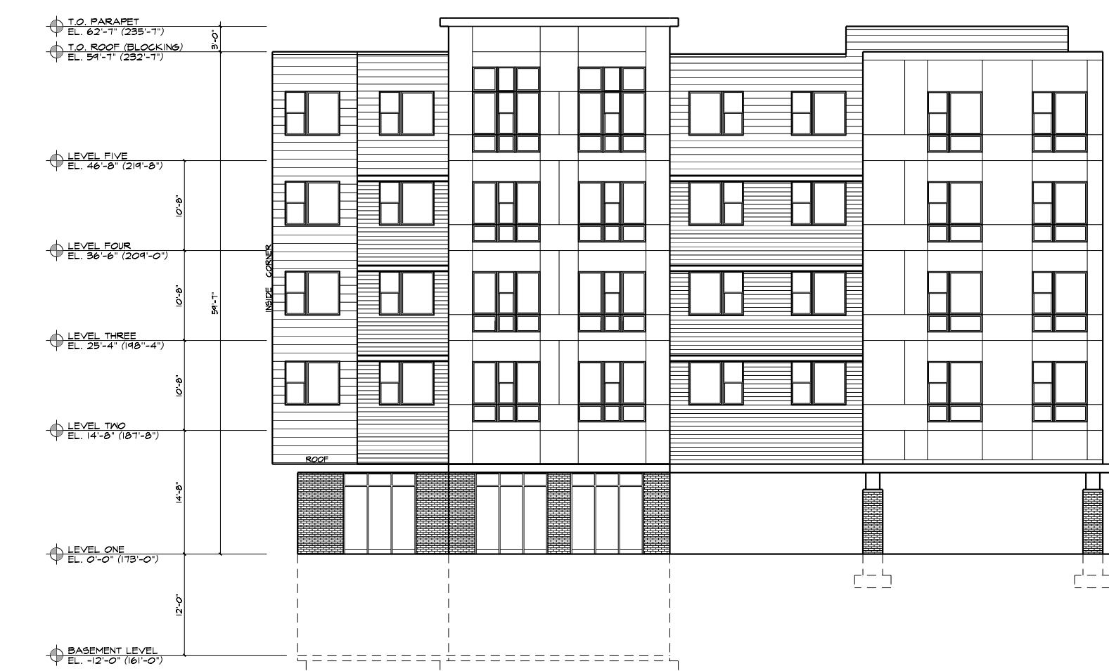
3 PARTIAL NORTH ELEVATION 1/16" = 1'-0"