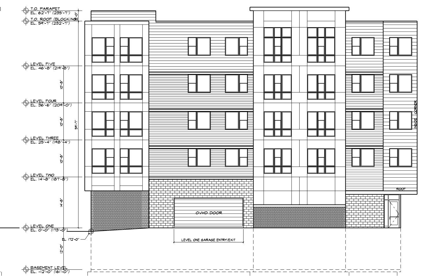
2 PARTIAL SOUTH ELEVATION 1/16" = 1'-0"